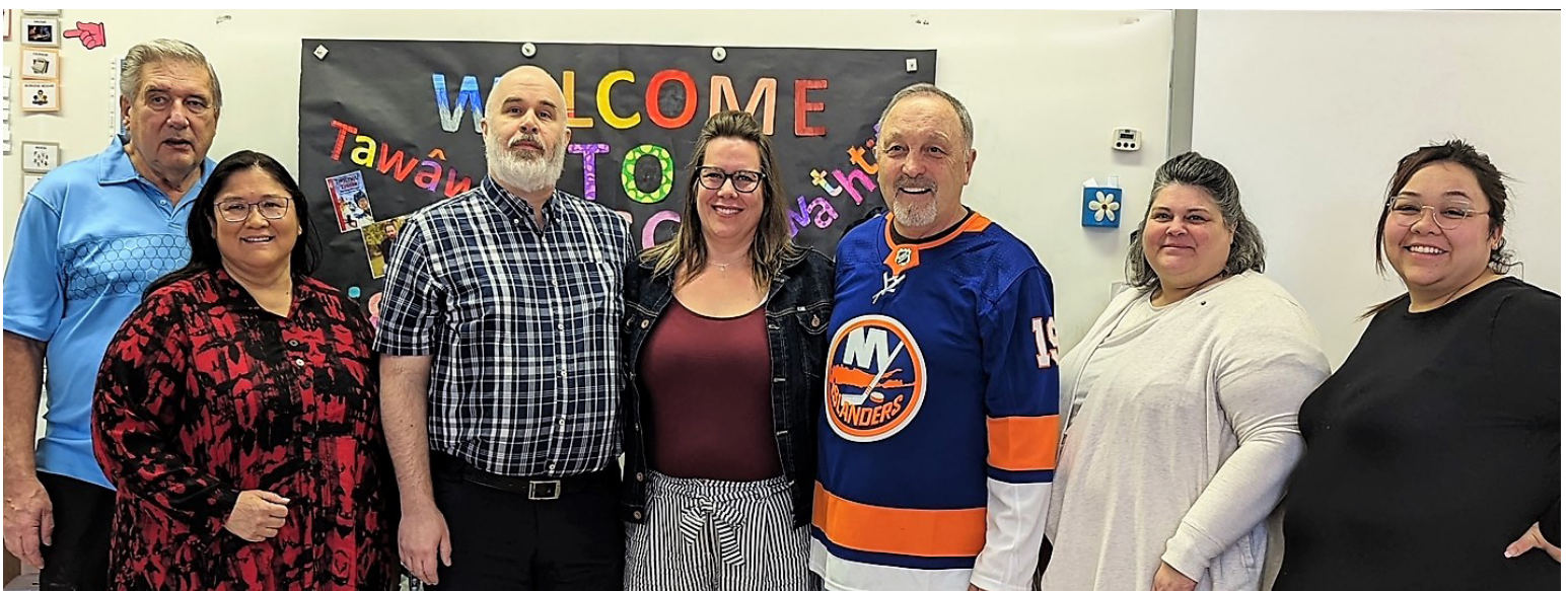
Below: Our staff posing with hockey legend, author and literacy advocate Bryan Trottier.