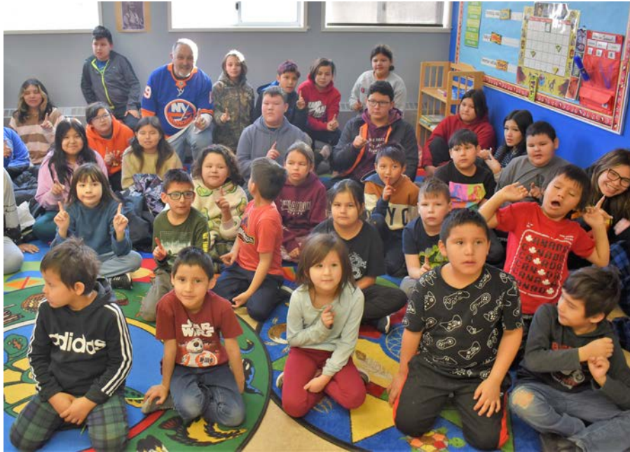
Bryan Trottier visiting with MECCS students (above) and demonstrating how he lifted the Stanley Cup (right).