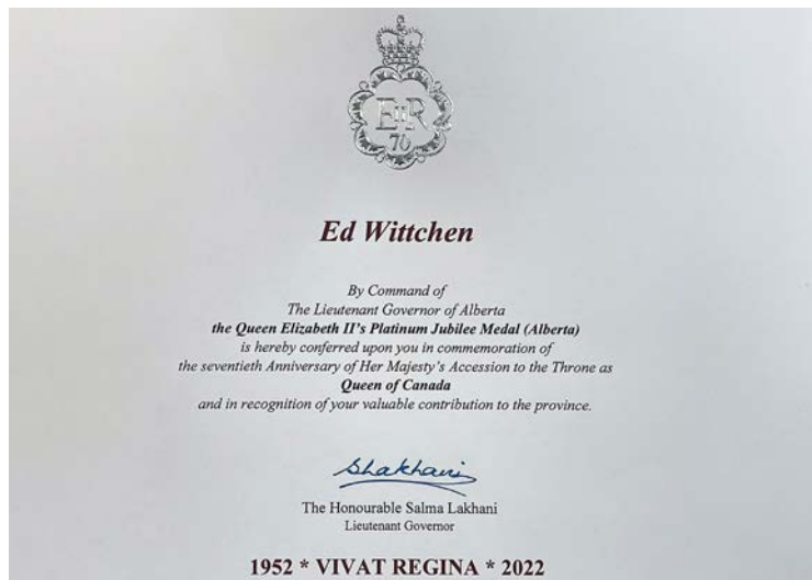
Right: The Queen Elizabeth II's Platinum Jubilee Medal.